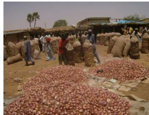
Fig. 3: Onion Market - Kalmalo

Farming is the major economic activity in the area. Majority of the people are subsistence farmers engaging in both rain fed farming and fadama farming. Crops grown in the dry season under fadama farming include onion, tobacco, rice and maize. Crops grown under rain fed farming on the other hand include millet, sorghum, maize, and cowpea. Kalmalo is one of the major areas producing large quantity of onion within the basin and Sokoto state at large. Animal rearing is another important economic activity in Kalmalo area. Animals particularly cattle, sheep and goats are kept by both the Fulani pastoralists and sedentary Hausa farmers as symbol of wealth and source of income. Fishing used to be important in the community, but this has completely stopped due to the drying up of Lake Kalmalo. The major constraints to farming in the area are, drought, active sand dunes burying prime farmlands, weeds, pests, lack of farm implements and poor means of transportation. Similarly, the major constraints to livestock rearing in the area include; inadequate grazing reserve to accommodate the growing animal population, scarcity of dry season fodder, inadequate water points for the animals and lack of vet nary facilities.