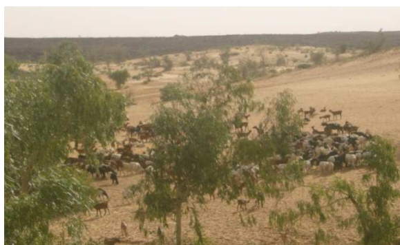
Fig. 4: Fulani pastoralist Searching for Pasture - Gidan Kaura

Sources of Energy: Fuel wood and animal dung are the major sources of energy for domestic use in the communities. Cutting down of trees contributes to the process of desertification and land degradation in the area, while the use of animal dung deprives the soils of organic materials. Lack of alternative energy sources, poverty, level of illiteracy and increasing population has exacerbated the problem. There is also complete absence of either Government or civil society intervention to address these challenges.