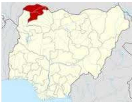
Fig 1: Map of Nigeria showing Sokoto state.

The methodology of this study involved review of available literatures and field survey. The desk review entailed searching national and international publications on community practices on natural resources utilization in the dry land ecosystems. Each practice area was theoretically assessed with respect to its capacity to promote sustainability in water resources management, management of vegetative cover, dry land farming, natural resource management, drought preparedness and coping capacity, pastoral development and management. Such an appraisal of existing research and coping mechanisms with environmental challenges in dry lands, permits the development of a conceptual framework for the identification of key issues that needed to be explored or clarify during the field survey that centered on consultation with local communities, policy and decision makers, researchers and scientists, on land use and conservation issues. Working within the broad spectrum of the Integrated Water Resource Management, this study employed the exploratory and topical Rapid Rural Appraisal (RRA) in the interview and field survey, using semi-structured group and individual interviews.