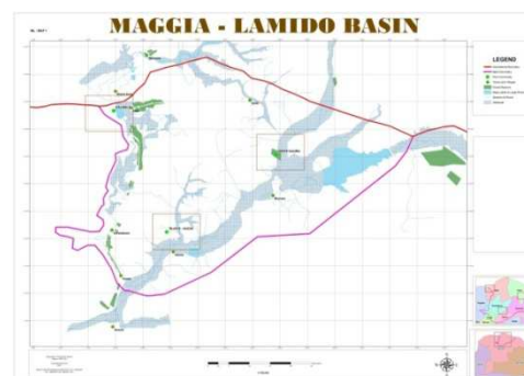
Fig 2: Map of Maggia-Lamido River Basin

water only between July and October with annual discharge varying between 3 to 92mm per year (Agunbiade, 2002). A significant part of the river is captured in ponds and does not reach Lake Kalmalo. In Nigeria the water from Lake Kalmalo is used for drinking, irrigation and fishing. The Maggaia-Lamido River Basin cuts across Illela, Gwadabawa, Wurno, Goranyo, Gada, Sabon-Birni Local Government Areas of Sokoto State.