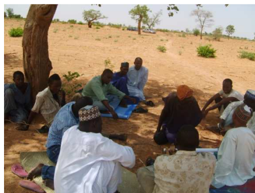
Figure 6: Focus group discussion with the community members

Opportunities and Threats of the River Basin The persistent ecological challenges facing the communities around the river basin over the years has resulted in devising local adaptation strategies which increase their resilience to the impacts of draught and climate change. This community based approaches ranges from water resource management to land use, farming practices and energy supply. The community responses to the recurrent environmental challenges are summarized in table 3.