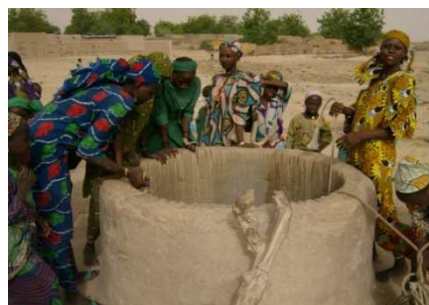
Figure 5: Hand dug well in Kalmalo Community

Drinking Water Supply: Water shortage particularly in the dry season has been identified as the most critical challenge facing most of the communities. Between the months of June – September, the river serves the communities with drinking water. While in the dry season, the entire community in most cases depends on a single hand dug well as source of water for drinking and other domestic uses (see figure 5 & 6). The water drawn from well or River is used directly without treatment. This has resulted to serious health problems in most communities around the basin.