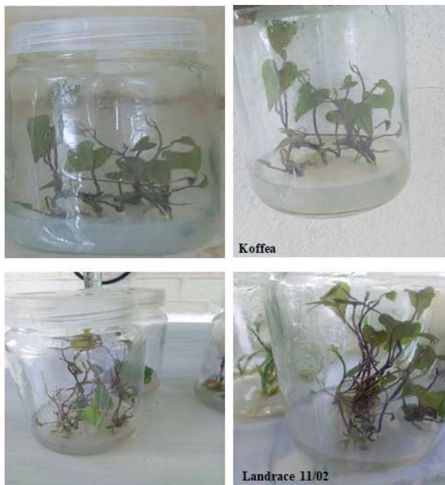
Figure 1. In vitro shoot multiplication for both koffea and 11/02 yam landrace on MS medium containing 3 mg/l BAP after 45 days of culture.

Note: BAP=Benzy Amino Purine. LSD=least significant difference, Means with the same letter in the same column are not significantly different at 0.05 probability level, CV=Coefficient of Variation.