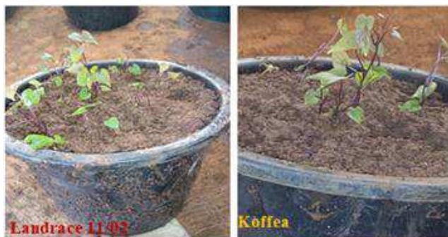
Figure 3. Acclimatized plantlets of two yam koffea and 11/02 landraces after a month in greenhouse.

On other hand, cv. koffea exhibited about 86% of survival rate at ex vitro condition and this finding was similar with finding of Obsi et al. , [42] and almost similar survival rate (80%) was obtained by Kadota and Niimi, [34] when micro-propagated plants of D. japonica were transferred to pots containing (1:1) vermiculite and soil (v/v) mixture under greenhouse.