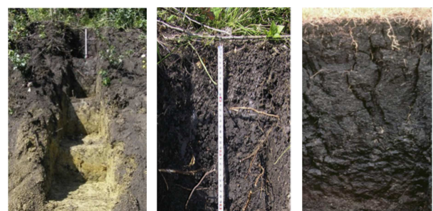
Figure 2. Vertisols soil profile.