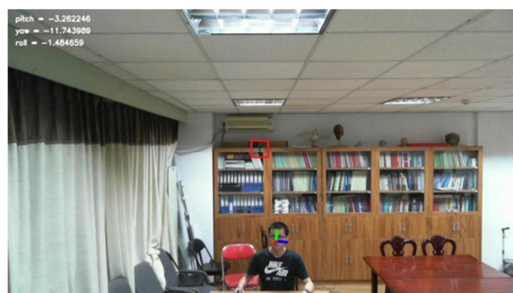
(b). The installation position of the rear camera and the visualization of the head posture of the subject.