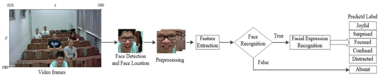
Figure 3. Learning Expression Recognition based Classroom Teaching Automatic Evaluation System.

surprised, confused, focused, and distracted shown in Figure 4 can be recognized [8].