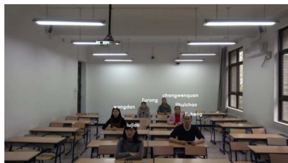
Figure 1. Face detection and face recognition based classroom automatic attendance.

As shown in Figure 1, we can use the deep learning technology to process the classroom instructional video and perform face detection and face recognition for each student to automatically judge whether the student enters the classroom and whether the head posture shows abnormal. In addition, we can also make real-time attendance of five abnormal situations, including being late, leaving early, skipping school, going in and out of the classroom at random, and not listening carefully.