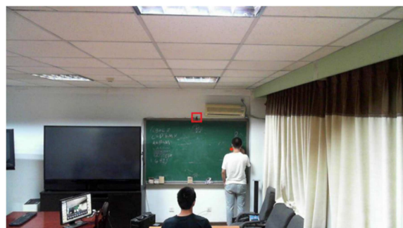
(a). The installation position of the front camera and the visualization of the visual projection point of the subject.

The visual analysis of students' attention is to locate the students' attention through technical means. As shown in Figure 2(a), first, we use the camera installed above the center of the blackboard to perform head posture recognition on the students who attend the lecture, thus we can obtain the three-dimensional coordinates of the student's head posture (mark at the tip of the student's nose) as shown in Figure 2(b). Next, the student's line of sight can be calculated based on the student's head position (X/Y/Z) and three-dimensional coordinates of the head posture. Finally, the student's point of view is marked in the instructional video shot by the rear camera. As shown in Figure 2 (a), the student's point of view falls below the teacher's left ear.