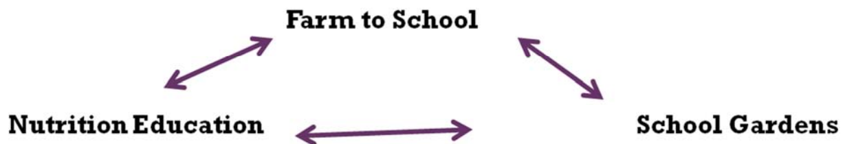
Figure 1. Concept of integration in nutrition education and school garden.

Got veggies? Garden-Based Nutrition Education Curriculum [50]. Got veggies? Program is a garden based educational nutritional curriculum developed with the aim of enhancing consumption of nutritious food and vegetables among children. This curriculum was developed specially for pupils in Grade 2 and Grade 3 and had lesson plans aligned with the Wisconsin Model Academic Standard. The learning activities for this curriculum are appropriate for elementary school pupils. The garden based education curriculum encompasses garden based activities, preparing recipes and cooking for eating in the garden itself. This curriculum provides an ideal strategy for educating and encouraging interest in consuming fresh fruits and vegetables. It is a comprehensive program for integrating nutritious food and also gardening skills in school.