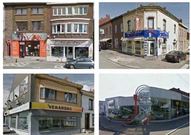
Figure 6. Commercial formats in Rue de Marchienne (By Authors).