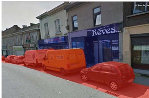
Figure 5. Parking lane on Rue de Marchienne.

The greatest streets are ones that support the movement of pedestrians by extending a street wall with visual interest. An easy visual transition between commercial street exterior space and building interior space can be created by the use of storefront glass windows, outdoor commercial activities and sidewalk stalls. Shops along Rue de Marchienne with commercial advertising posters on the storefront window attract walk-bys with the opportunity coming in for shopping. These posters on the storefront glass window don't be changed to new ones for several months. The outdated posters turn into a barrier of visual interest then. As mentioned before in this paper, cars stopped in front of buildings also become an impermeable barrier for people to see through the window glass (Figure 5).