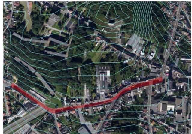
Figure 1. Location and topography of Rue de Marchienne, Belgium.

Jumet, commercial services are there serving the locals. There is relatively dense network of neighborhoods shops. At the same time, it is in close proximity to transportation nodes and near local historic town center—Place du Ballon.