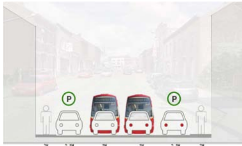
Figure 4. Street cross-section of Rue de Marchienne (By Author).

A street with high quality encourages walking by, slow traffic and enhancing pedestrian safety. Figure 4 shows the cross-section of Rue de Marchienne. In the 15-meter wide street, a 2.5-meter parking lane and 2-meter pedestrian lane are on each lateral side of the street. The design of this type cross-section is seen as a buffer to encourage all flows to slow down. While it looks like a paradox for the parallel parking buffer here. The problem is that when car stops at the parking lane, it cuts off the pedestrian's visual interest. Pedestrian on each side of the road can't keep eyes on the street. This buffer doesn't support a safe, friendly pedestrian environment.