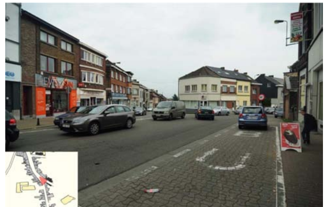
Figure 3. A triangle shaped open space in the middle part of Rue de Marchienne.

Open space is a key element of street morphology. It refers to the public space in front of street buildings. Such public places as plazas, parks courtyards, and playgrounds draw people’s attention to the unique qualities of a particular area of the street as well as attracting people with related social interactions. Putting yourself in the role of somebody using the open space of Rue de Marchienne, you are not easy to find a place to take a rest. The only choice is to walk straight further to the Place du Ballon where there are a few benches for sit. Complexity of spaces in Rue de Marchienne is few. Figure 3 shows a triangle shaped open space formed by the intersection among Rue de Marchienne, Rue de Dampremy and Rue de Marchienne. This area is in the middle section of the street with a potential to be an interesting public space for people gathering and stay. While it is only used as a traffic node and is dangerous and dull for the locals. The lack of people leads to the low vitality of local small and medium street economy. Rue de Marchienne doesn’t have enough civic activities as a local commercial corridor for its scarce of open space.