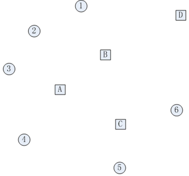
Fig. 2. A city's residential areas and workplaces distribution.

There are 6 residential areas and 4 workplaces in a city, see Figure 2. The circle nodes and block nodes respectively represent the residential areas (or parking lot in residential area) and workplaces (or parking lot in workplace).