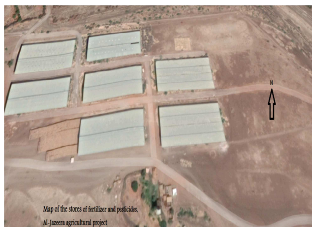
Figure 1. Map of stores of fertilizer and pesticides Al-Jazeera agricultural project.

80 soil samples weighing 500 g were collected from different areas of the fertilizer and pesticide stores of Al-Jazeera Agricultural Project in Al-Hasahisa area. The samples were crushed and screened and placed in plastic cans and were closed tightly for a period of four weeks to get rid of the radon element. The germanium detector was calibrated by investigation by collecting spectra data from standard sources with energies ranging from 0.25 to 2.62 MeV. Then, the energies at the top of the number of different spectra were recorded for every 900 seconds, and the values of the energies were compensated in mathematical equations to obtain the concentration of the elements in the sample.