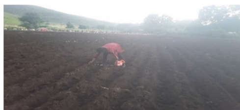
Figure 2. Measuring furrow width and length at Hara Deneba Kebele.

Planting of wheat was done on farmers' field by researchers, DAs and farmers. Field managements such as weeding, thinning, watering and others were done. Fields were managed by participant farmers with close supervision of researchers and DAs. Frequent field visits to farmers land, monitoring, and follow up actions were done based on knowledge and technical needs. The improved wheat varieties called Ogolcho and Pavan-76 were used for the study. Seed rate of 150 kg/ha was used. Space between ridges was 20cm and furrow length ranges from 20-30m for uniform water irrigation purpose. 150 kg ha -1 Urea fertilizer (in split: one third during planting and the rest at tillering stage) while 100kg/ha NPS was applied at time of planting.