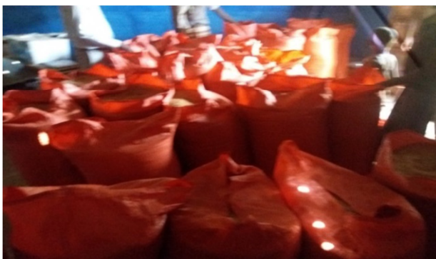
Figure 5. Yield of wheat at Hara Deneba.

From the above table there was significant mean difference between Ogolcho and pavan-76 varieties in terms of mean yield in quintal per hectare. There was significant mean difference between two varieties at 1% significance level.