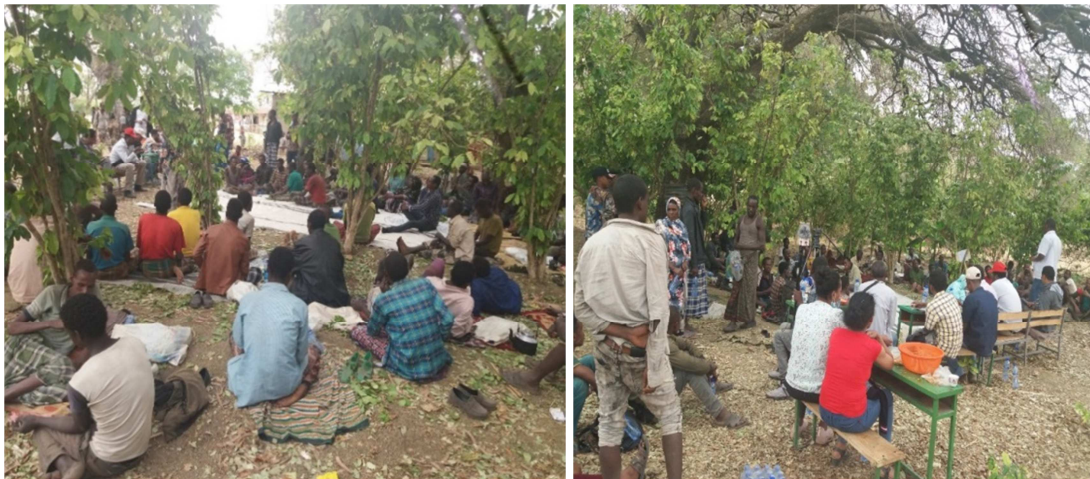
Figure 3. Pictures captured during training for farmers about irrigated wheat production at H/Deneba.