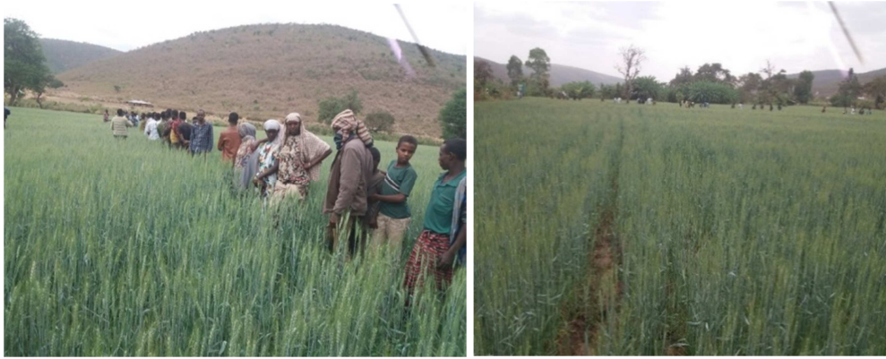
Figure 4. Pictures captured during field day organized.