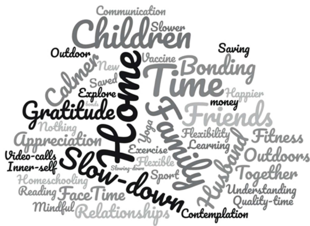
Figure 2. Silver Linings of COVID-19.

The word clouds provided the overarching a priori themes: Black Cloud and Silver Linings. The initial template was expanded upon with secondary themes emerging as illustrated in Table 1. In what follows, each of these themes will be explored with references both to the evidence in the data, as well as links made to the literature.