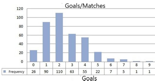
Figure 1. Goals per match of the Brazilian Championship 2017.

Analyzing the data from the 380 games of the 2017 Brazilian Championship, it is noticeable that there was a distribution of goals per match, as shown in the figure below.