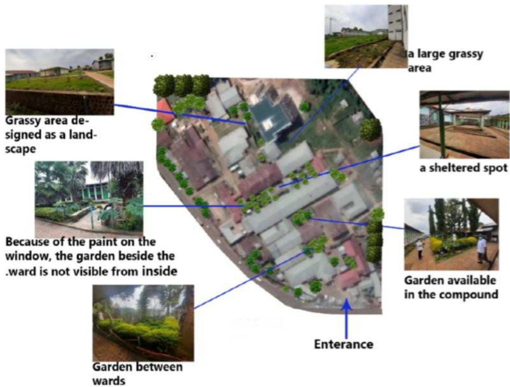
Figure 4. Picture of existing compound of NSH.