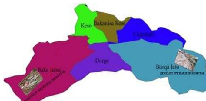
Figure 1. Study area.

The therapeutic landscape has seen a significant increase in attention in recent years. These landscapes are specifically designed to address a variety of applications within healthcare, therapeutic, rehabilitative, and other contexts [8]. The American Society of Landscape Architects, in fact, has a professional practice network of consultants that specialize in therapeutic garden design. Green spaces such as gardens, pathways lined with trees and green walls infuse a sense of vitality into the hospital. Furthermore, trees and plants release oxygen and humidify and cool the atmosphere [14].