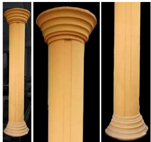
Figure 6. Finished terracotta clay arc décor (Adebowale, 2020).

Installation: After firing, the work was installed with the aid of plaster sand and cement. The mixture was done to a thickly pulp and applied indiscriminately on the inside of clay arc décor and subsequently installed on a building pillar (figure 6).