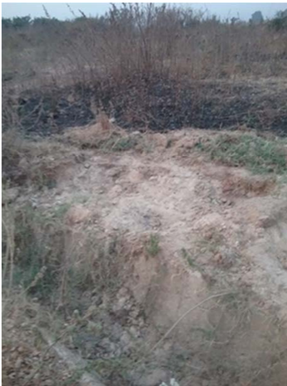
Figure 3. Clay deposit at Giri (Adebawale, 2020).

Site identification: The researcher visited the clay site to collect relevant clay materials around Giri junction, Gwagwalada Area Council FCT Abuja which is noted for abundance deposit through a research informant to negotiate clay site with the district head and chiefs for hitch free clay collection (figure 3). The effectiveness of the clay is ascertained by its strength being clay which has been used by the students and lecturers in the department of fine and applied arts of the FCT College of Education Zuba Abuja for over a decade.