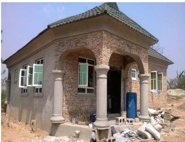
Figure 1. Concrete column designs (Adebawale, 2020).

Nowadays, architecture is trendy and fashionable with many foreign industrialized raw materials and accessories. For instance, the use of cement, plaster of paris, plastics, glass and polystyrene to mention but a few in building a house is on the increase especially the use of concrete column design (figure 1). Unfortunately, these materials are imported at the expense of local productivity and heighten tension on foreign exchange.