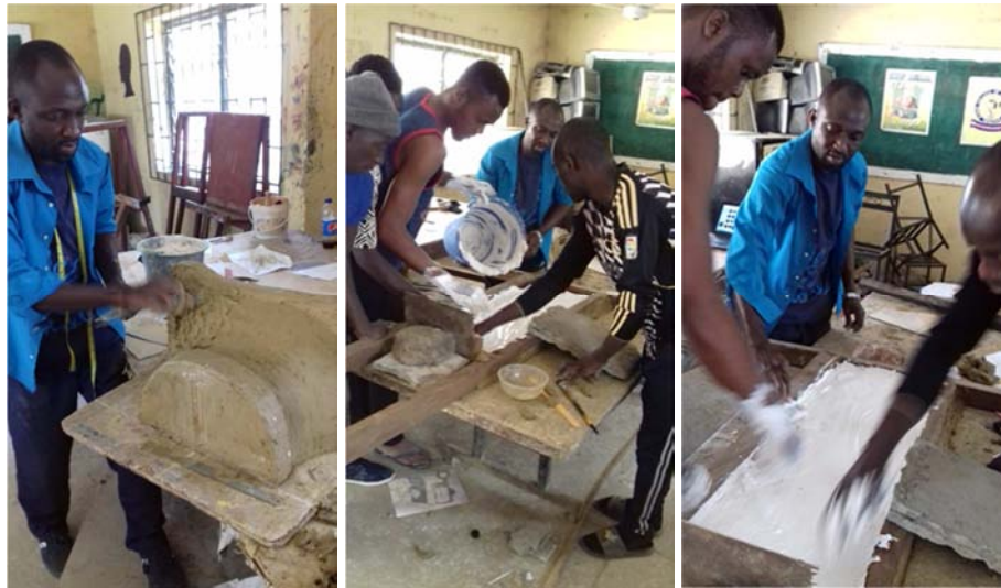
Figure 5. Modeling, mould making and casting (Adebowale, 2020).

Balls of clay were fetched to form a solid mass and hand building was done to shape up the pillar in half diameter. The shape was creatively sculpted out of the mass clay using spatula set. In order to achieve a perfect cylindrical form, plywood was cut in the same diameter form of the column and used to straightening the shape. The neck and bottom part of the column designs were made out of four slaps and joined in layers to the main body to form concentrically ring.