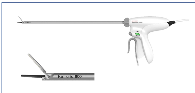
Figure 1. HARMONIC 1100 Shears with next generation Adaptive Tissue Technology.

The current generation of Harmonic shears (HD 1000i, ACE+7, and ACE+), are multifunctional devices that can be used for dissection, coaptation, coagulation and transection during laparoscopic or open surgical procedures. Recently, a new Adaptive Tissue Technology system was developed to deliver a more precise amount of thermal energy during tissue transection and vessel sealing. This new Adaptive Tissue Technology algorithm actively limits the maximum temperature of the ultrasonic blade to lower levels, which is designed to provide enhanced protection of tissues and surrounding vital structures and still deliver effective cutting and sealing. This feature may also improve efficiency by allowing surgeons to fully focus on the procedure, while maintaining confidence that the device provides effective thermal management. The aim of the current study was to evaluate HARMONIC 1100 Shears (Figure 1), in comparison to the previous version, HARMONIC HD 1000i Shears for vessel sealing performance, lateral thermal spread, and temperature management using bench-top and preclinical models.