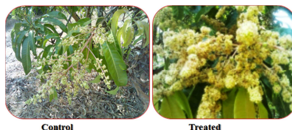
Figure 2. Flowering pattern of Alphonso mango ( Mangifera indica L.).

Clusters of fruitlets were observed in large quantity giving an appearance of 'jhumka' in the control sample. However, no such types of cluster of fruit lets were observed at the tip of the panicles. The weight of natured ripened mango was found on average 275 gm, medium sized with 50% lesser pulp in the control, while the biofield energy treated trees showed on the average weight of 400 gm, large sized and having more than 75% higher pulp.