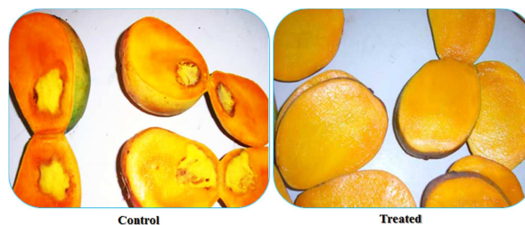
Figure 3. Representative photograph of mangoes with spongy tissue disorder.

After maturation of mangoes, the spongy tissues content were observed in fruit at ripe stage approximately 80% fruits were affected and at 16 anna maturity level about 60% fruits were affected with spongy tissue in control fruit. However, in biofield treated sample at 16 anna maturity stage the spongy tissue disorder was completely eradicated. The representative photomicrograph related to spongy tissues of control and in the treated mangoes are shown in Fig. 3.