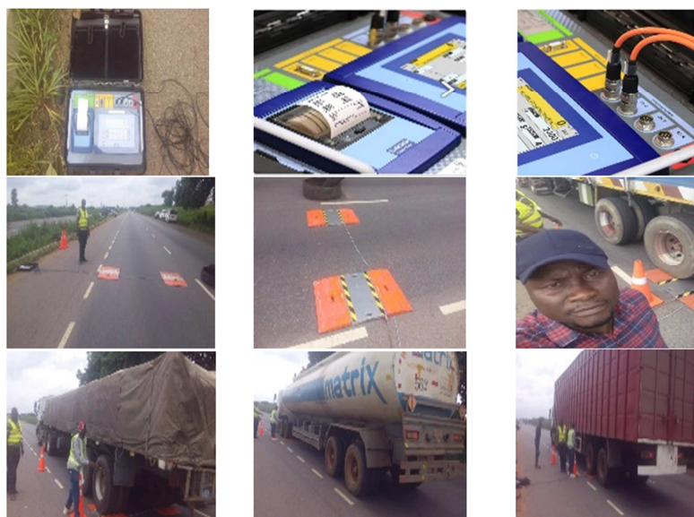
Figure 2. On-site Equipment Layout and Truck Axle Loads Capture.