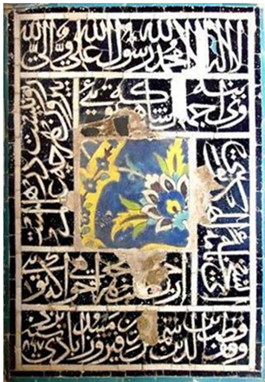
Figure 2. Inscription of square mosque in Kashan [18].

quatrain of Pourya-ye vali (type of poem) can be found which all has wisdom and mystical concepts. This quatrain has some advice which recommends men to stay away from fools and effort for better life (Fig. 3).