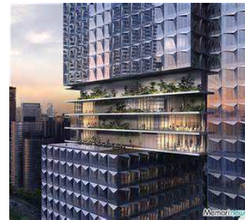
Figure 3. An example of the modular System.

Modular systems are targeted systems which in them we have harmony of components and reproducibility. The process followed during the production, manufacturing and debugging in there. To determine the modulus size, dimensions and functional spaces include various aspects of performance, the media and communication spaces are studied and the optimum size based on climate, standards and optimal price is determined. The separation of structural elements including walls, ceiling and wall pieces, and stair openings, etc. are studied. Outcome of study is to determine the cause of dimensional moduli spaces of stable architecture. The modules can apply in small spaces, combining different spaces, combining building blocks, urbanism and building materials and systems [11].