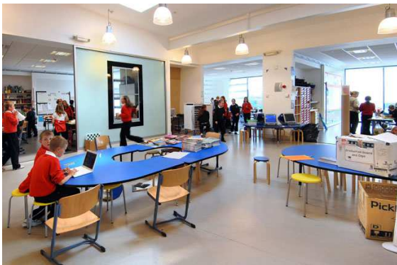
Figure 2. The flexible designing of open planes.

The flexible architecture includes buildings that are designed to respond to changes in their lives. The idea of technology for flexible buildings made possible the maintenance of the building and applying the necessary changes without the high cost of implementation. For this purpose, layers of building in sustainable architecture consist of mass (structural and bearing shells), service sector (pipe, duct, cable, elevators, escalators, etc.), stage (partitions, ceilings, plastering) and device (for furniture moving, etc.) separately and with the opportunity to enhance compatibility with the designing life. Also in modern construction methods, sustainable architecture, the use of flexible structures has caused the structural components to easily be replaceable, reusable and recyclable.