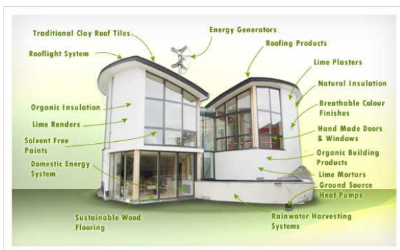
Figure 4. Using of green materials in sustainable designing.

The most important selection criteria for green building materials are: