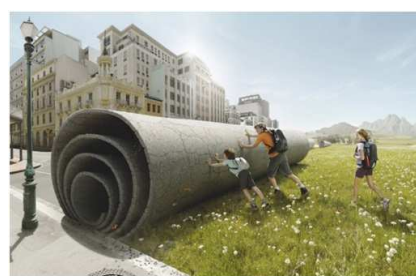
Figure 1. Green Architecture.

Design and construction of sustainable man-made spaces in terms of architecture and urbanism can only be achieved worldwide when the principles of sustainable architecture and tools and components as a common language to be used in creating these spaces. The prerequisite to achieve this objective is to recognize the alphabet of designing sustainable architecture and its reflection in the form of new construction.