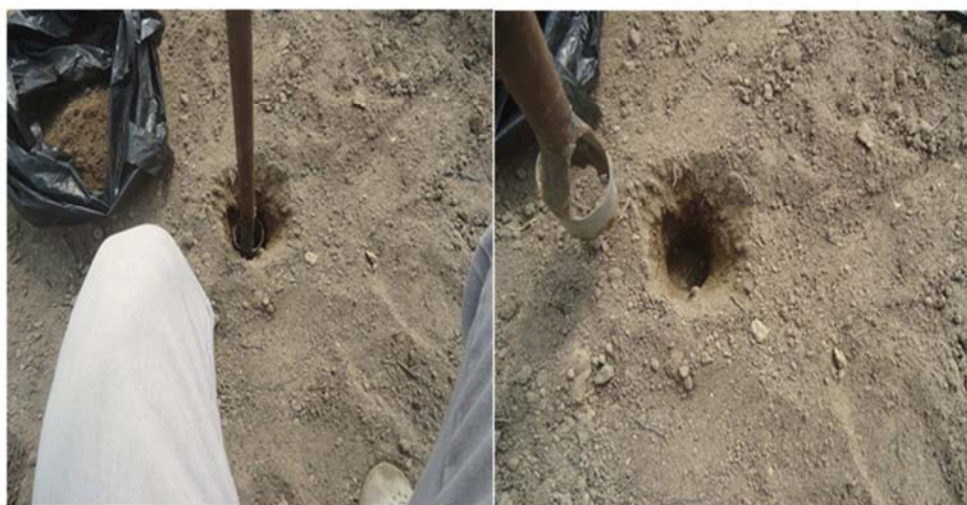
Figure 2. Illustration of use of hand corer for soil sampling.

was cleaned, and stones, pebbles, and root parts were removed. Soil samples were oven-dried at 110°C for 24 h to remove moisture. Then, the soil samples were grinded and sieved through a 2 mm nylon mesh to remove large debris, stones, and pebbles.