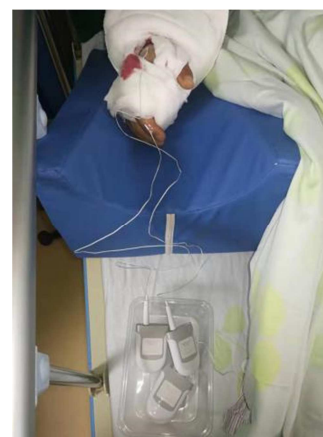
Figure 2. The probe of the skin temperature monitor.

Besides routine nursing care for flap transplantation, continuous skin temperature was also given to the observation group, including the following measures: (1) A company's MH-70N skin temperature monitor was used. The skin temperature value measured by the thermistor of the monitor was transferred to the central skin temperature management system via Bluetooth to WIFI, and the patient's skin