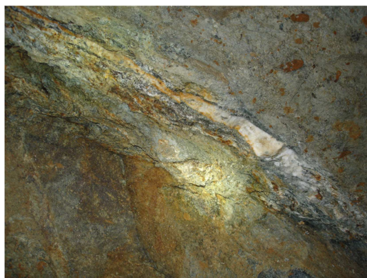
Figure 1. Vein of metal sulphides and precious metals, Bella Rica Mining Cooperative (Ponce Enríquez mining district, Azuay province, Ecuador).

In mining districts, gold deposits also contain metal sulfides such as pyrite, chalcopyrite, arsenopyrite, galena and sphalerite, and being exposed to the action of air and water are involved in a series of physical, chemical, and biological phenomena. Thus the oxidation of sulphides to sulphates by the catalyst action of bacteria such as Thiobacillus Ferrooxidans , T. Thiooxidans , T. Sulfooxidans , T. Thioparus , among others, occurs in addition to the production of sulfuric acid that dissolves heavy metals such as iron, copper and zinc; so-called bioleaching. These solutions, with a high level of acidity, pH around 2, are dragged by streams of water or runoff, being a powerful pollutant of water and soil [10].