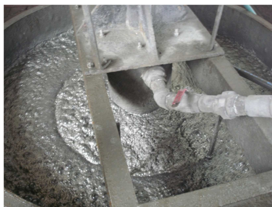
Figure 2. Floating foam containing precious metal, process used in the Sominur Company (Machala, El Oro province, Ecuador).

The concentration aims to produce a high-grade concentrate in small feeding fractions in order to produce a cheaper treatment or also to reject the portion of ore that does not contain valuable metal to reduce the volume of the ore that passes to the next process. In addition, it can be used to reject a portion of the ore that could impair the next process in the extraction of valuable metal. Concentration processes can be gravimetric concentration, flotation, amalgamation, electrostatic separation, and magnetic separation [17]; see Figure 2.