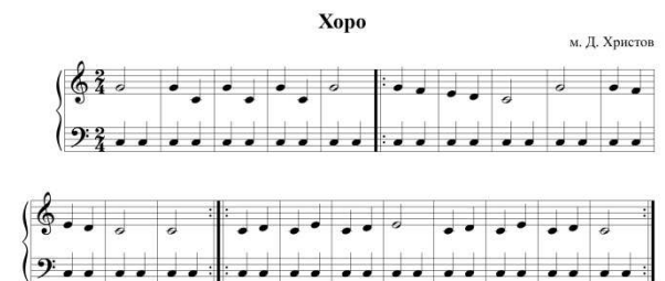
Figure 3a). Horo (Bulgarian folk dance), music: D.Hristov

In the next period of training the students will master the skill to synchronize performance with both hands – a simple melody for the right hand with a repeating tone for the left hand (over the principal bass):