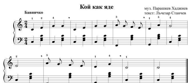
Figure 7. Song (music: ParashkevHadzhiev, text: LachezarStanchev, song title: How Everybody Eats) slowly

Subdominant function (S) appears in the accompaniment during the next lessons: