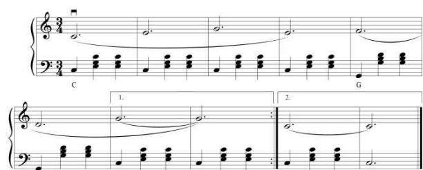
Figure 6. Melody in triple metre

The same skill is acquired by performing melodies in triple metre: