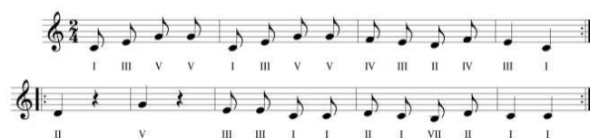
Figure 8. Mode-degree structure of the melody of Figure 7

After determining the tonality of the melody, its mode-degree structure will be determined, too: