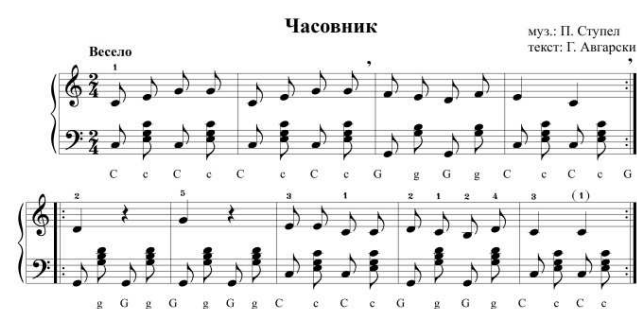
Figure 9. Song (music: P. Stupel, text: G. Avgarski, cheerful, song title: The Watch)

In this case, the first, second, fourth, seventh and ninth bars have a tonic function and the third, fifth, sixth and eighth bar dominant function, but we will clarify that the fourth mode degree is included in the dominant septachord (D7). This must be observed, analyzed, listened to and performed by students.