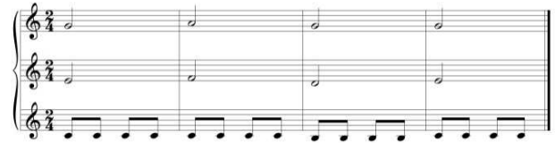
Figure 2b). Example for rhythmic movement

At the same time, students listen to a large number of melodies performed with a suitable chord accompaniment that will make it possible for them to acquire a rich sound experience for: