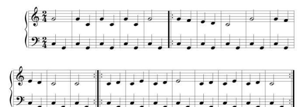
Figure 3b). The left hand part changed

The complication of the technical task comes with the slight change of the left hand part, training the performance habit of quickly finding the two principal basses located one above the other: