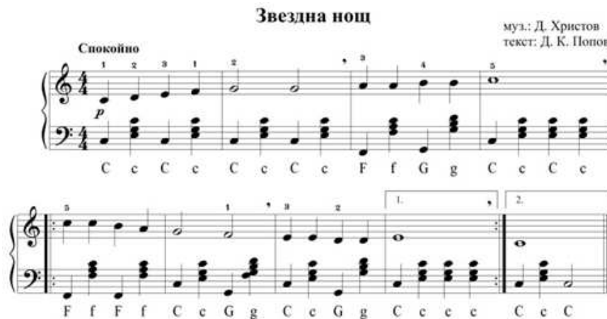
Figure 15. Song (music: D. Hristov, text: D. K. Popov, calmly, song title: Starry Night)

The students had no difficulties in composing a proper chord accompaniment to the following melody: