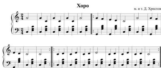
Figure 5. Horo (Bulgarian folk dance), music and text: D.Hristov

Achieving this skill allows the use of the two basic functions of harmonic accompaniment – T and D: