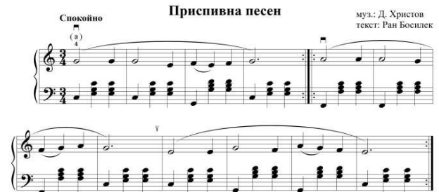
Figure 13. Song (music: D. Hristov, text: Ran Bosilek, calmly, song title: Lullaby)

The next explanations refer to the participation external of tones in the melody that must be harmonized – tones that decorate the melody, appear in a weak metric time and are not included in the structure of the specific chord: