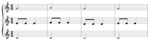
Figure 2a). Example for rhythmic movement

As the sound of the bass is the most difficult to make, rhythmic movement of the basses is performed: