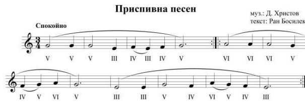
Figure 11. A song (music: D. Hristov, text: Ran Bosilek, calmly, song title: Lullaby)

The functions are determined after the mode-degree analysis: