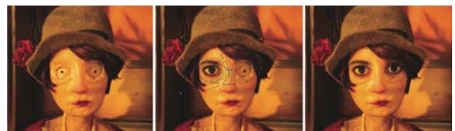
Figure 10. A progression of steps showing the puppet's tracking markers, masks, and composited eyes. Madame Tutli-Putli (2007).