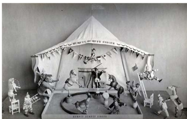
Figure 1. Humpty Dumpty Circus James Stuart Blackton, Albert Edward Smith (1897).

From this moment, the history of puppets in cinema can be divided into the history of special effects, which makes terrifying creatures come alive and interact with real actors, defined "Dynamation" by Ray Harryhausen, and that of animated films. In both types of films puppets have always been the protagonists and the evolution of stop-motion is strictly related to the technique of fabrications and to the history of the materials used to build them.