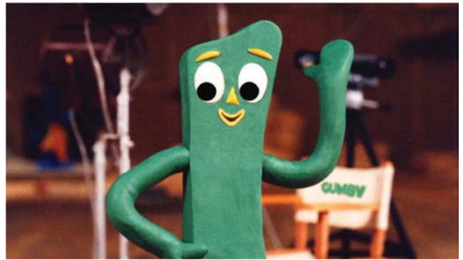
Figure 3. Art Clokey's green clay humanoid Gumby First appearance 1954.

work of Peter Lord and Dave Sproxton [...] and the creation, in 1976, of Morph (Figure 4), the small terracotta man who interacted with the TV programme's artist Tony Hart» [7].