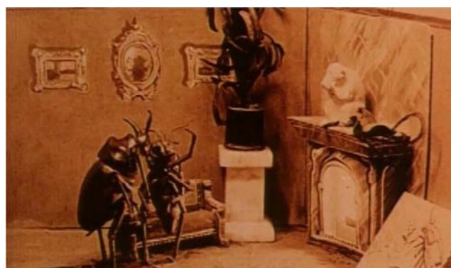
Figure 2. The Cameraman's Revenge - Ladislav Starevicz (1912).

In the book Stop-Motion Puppet Sculpting , Brierton defines the build-up technique «the precursor of foam injection», first applied by Marcel Delgado in the film Mighty Joe Young in 1949 [9]. According to Harryhausen, foam injection became the most common modeling technique applied to the design of animated puppets, because of the smoothness it produced in the puppets skin, and the easy reproduction of models potentially replaceable because they had exactly the same shape.