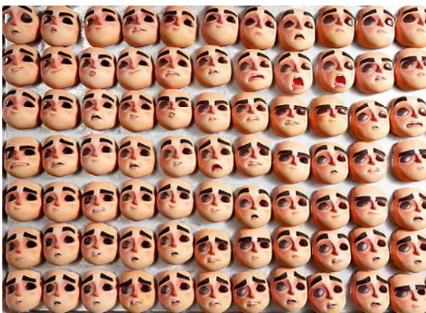
Figure 9. Norman replacement 3D printed puppet's faces ParaNorman (Chris Butler, 2012).