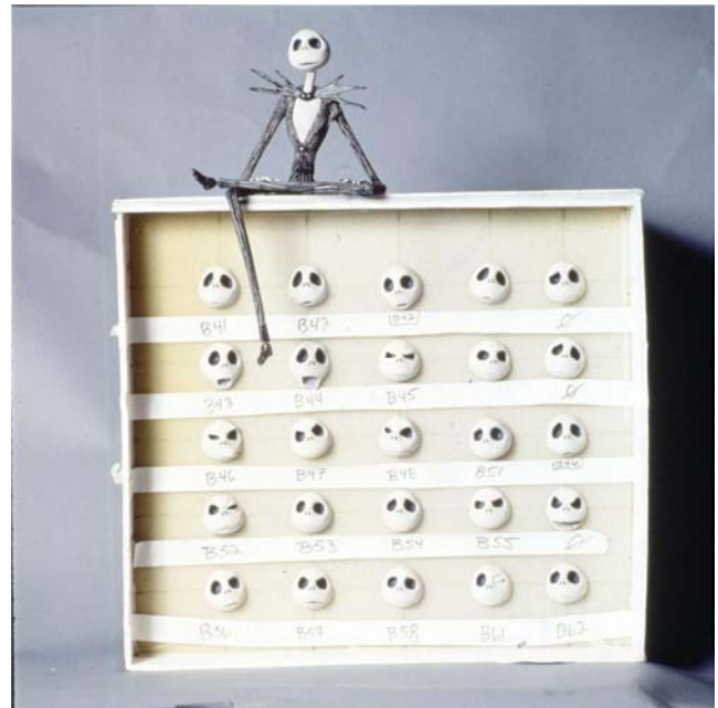
Figure 6. Jack Skellington's Replacement Faces Tim Burton's Nightmare Before Christmas (Henry Selick, 1993).

Jurassic Park , cinema saw the demise of traditional model animation used to obtain special effects in Dynamation . Harryhausen relates that Spielberg involved Phil Tippett, one of the most expert animators in dinosaur movement and behavior, asking the director to supervise the dinosaur animation for the film. However, during this project Tippett Studios went through a transition from traditional animation to computer-generated animation [1]. 1993, therefore, marks a new era for puppet animated films and the end of stop motion as support for the special effects field.