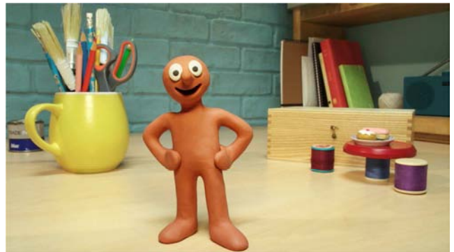
Figure 4. Preter Lord and Dave Sproxton's clay character Morph First appearance 1977.