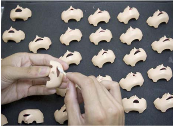
Figure 8. Coraline replacement 3D printed puppet's faces Coraline (Henry Selick, 2009).