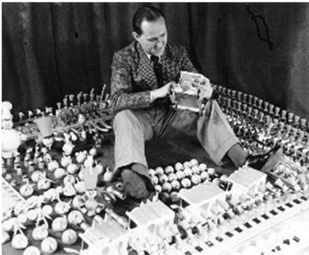
Figure 5. George Pal's Replacement Puppets.

The replacement object technique evolved after Pal's Puppetoons , and several animators and directors began applying it to replace single parts of the entire puppet using different materials. Replacement pieces such as heads or mouths are still very common today. Although this technique is most widely used as a way of creating mouth plates, limbs, faces or entire heads, replacing the whole puppet is a method still applied also with the newest manufacture technologies of 3D printed replacement pieces that I will be discussing in the following section.