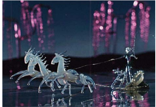
Figure 12. Inspirace , Karel Zeman (1949).

Stop-motion animation evolution's history counts also numerous material experiments, which saw animators and puppeteers challenging the possibility of material performances. Many of them were isolated experiments that were never followed. Nicolae Sfetcu, in the book The Art of Movies (2014), mentions a technique used by the Oscar-Winning animator Will Vinton (The founder of the term "Claymation") in 1974, and calls it "clay melting". This sub-variation of clay animation exploits the susceptibility of plasticine to melting in high temperatures [17]. There are few but relevant examples that use this cinematic technique, for example in the final scene of the 1974 short film Closed Monday , directed by Will Vinton and Bob Gardiner, when the computer melts in front of the protagonist, or in the final scene of Indiana Jones and the Raiders of the Lost Ark , directed by Steven Spielberg in 1981 [17]. Another experiment was conducted in 1949 by the Czech animator Karel Zeman. In the short film Inspirace (Inspiration) (Figure 12), Zeman fabricated «all characters or figurines [...] of glass and animated by heating them after each frame was shot to allow them to be moved» [1]. This was an extremely long process and this is likely the reason why, as Harryhausen suggests, no one else, not even Zeman, used it again.