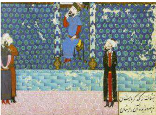
Figure 3. Lower part of the painting.

At the top of the main painting, dynamic elements such as animal, human, cloud, and bird exist compared to fixed elements such as big scarves, and shapes at the center of the paintings, that indicates dynamism of this section. The lower part consists of three elements of human, background, and the frame that contains the text. In this section, a man with a crown is sitting on a throne in the middle of the picture with his finger on his mouth and is looking up. Behind him and lower in the image, a person wearing a long robe is standing with crossed hands and is following the same look. On the lower left, two men with the same clothing as the man on the right are standing next to each other while one of them has clenched his hands and the other has his hands on his shoulder and looking up.