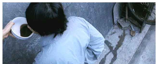
Fig. 4. Simultaneous consumption and elimination.

But Do-joon's sexuality signals danger, just as Hye-ja's sexuality is a threat to patriarchal order if exposed, and Hye-ja is arguably in the best position to comprehend this. Perhaps this is why, in the urinating scene, the Korean audience is able to read concern rather than sexual interest; her son's sexual vigor is a source of worry. The film also makes abundant references to Do-joon's sexual self-awareness. In the scene where Hye-ja feeds medicine to Do-joon, the camera sustains its focus on the stream of Do-joon's urine, flowing on the ground like a growing creature, suggesting Do-joon's virility (see fig. 4). The simultaneous consumption and elimination seem to hint, again, at his childishness, while the long trail of urine, alluding to sexual vigor, seems wasteful, unable to find an outlet.