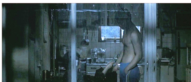
Fig. 1. Buying silence.

In this scene, Jin-tae openly asks for "alimony" ( wijaryo ), although the purpose of it is unclear as in many other ambiguities in the film (see fig. 1). But the clear implication is that she is buying silence from him, whether for past sexual encounter or current false accusation. If indeed she has bought sexuality from him, it is something that needs to be silenced at all costs, because her sexuality is something simply disallowed for her. If she has not, she Regardless of the veracity of sexual undertones, the image of Hye-ja kneeling before a hyper-masculinized male visually highlights his sexuality and her relative helplessness before it.