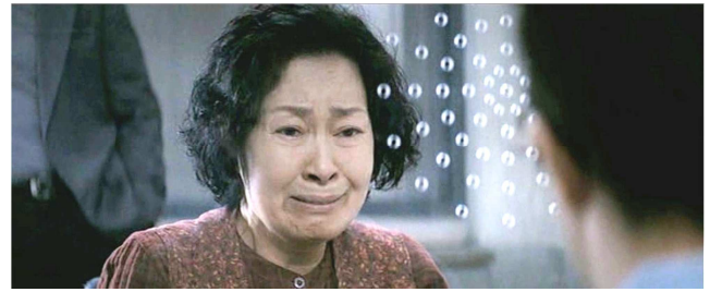
Fig. 6. You don't have a mother?

The film comes to an unexpected ending when the police takes in another suspect instead of Do-joon. When Hye-ja cries at the pseudo-perpetrator, another mentally challenged person like her son, she cries, “What about your parents... Don't you have a mother?” (see fig. 6). In her mind, her actions are justified, inevitable; and had Jong-pal had a mother, she would have done the same. And Hye-ja, in the name of the mother, will sacrifice another innocent person if she needs to.