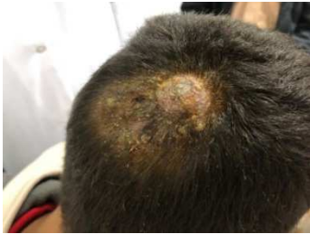
Figure 1. Inflammatory moth raised in macaron with pus output.

regular mycelial filaments of moderate abundance, rare microconidia with numerous spindle-shaped or elliptical macroconidia, more or less thick-walled, with transverse partitions determining a maximum of 6 logettes reminiscent of M. gypseum (Figure 4). These cultural characteristics were the basis for the identification of a strain of M. gypseum .