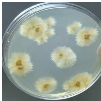
Figure 3. Petri dish culture: star-shaped fluffy appearance with a slightly protruding powdery center.