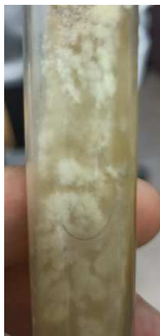
Figure 2. Culture in tube: plastery colonies of café au lait color.