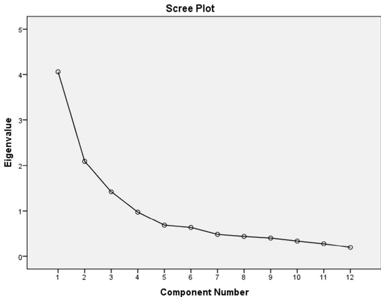
Figure 1. Cattell's graph of factor extraction.

The percentage of cumulative variance explained by the factors extracted is 71.22%.