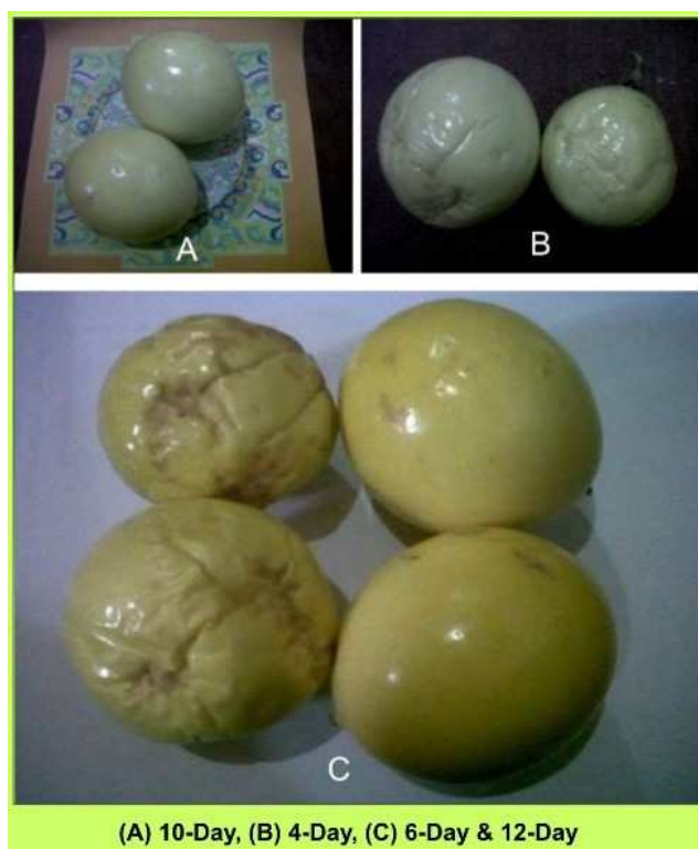
Photo 3. The marquisa fruit in the mandala.

Another finding in the chemical reaction of mandala water spray with the plants and trees, the rose apple fruits underwent a temporal change in its fruit-cycle, all colors have turned