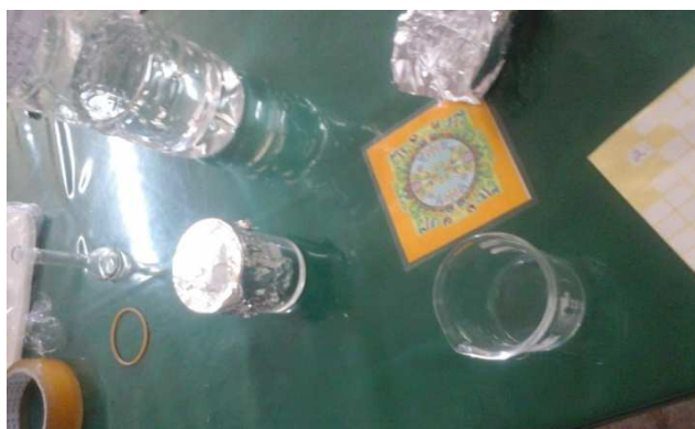
Photo 2. The mandala and the Ethanol.