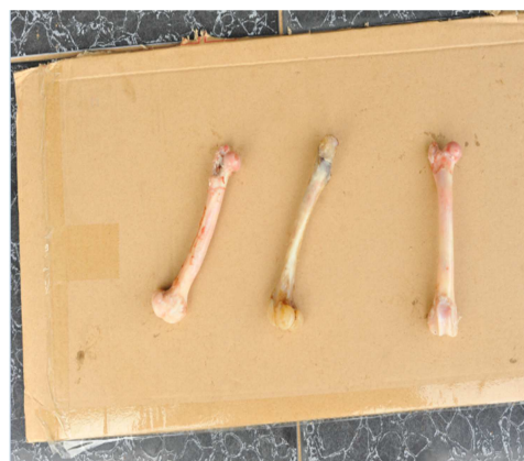
Figure 2. Goat femur bone.