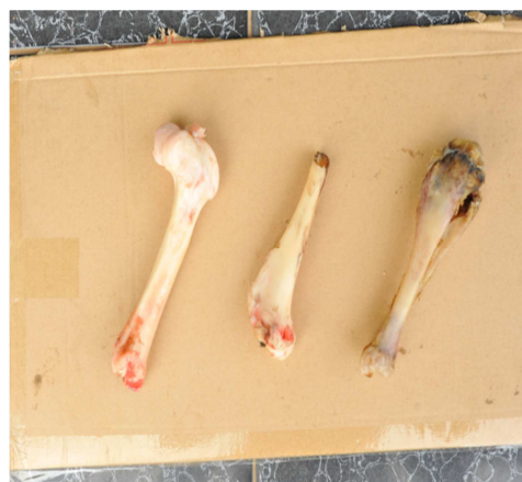
Figure 3. Pig femur bone.