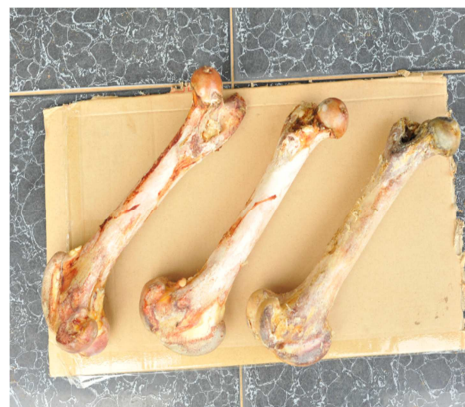
Figure 1. Cow femur bone.

Cow femur bones (Figure 1) were procured from Ubakala Abattoir, goat femur bone (Figure 2) was procured from Ndume Goat market and pig femur bone (Figure 3) was from Umuariaga, Umudike road side market all in Umuahia North Local Government in Abia State, Nigeria.