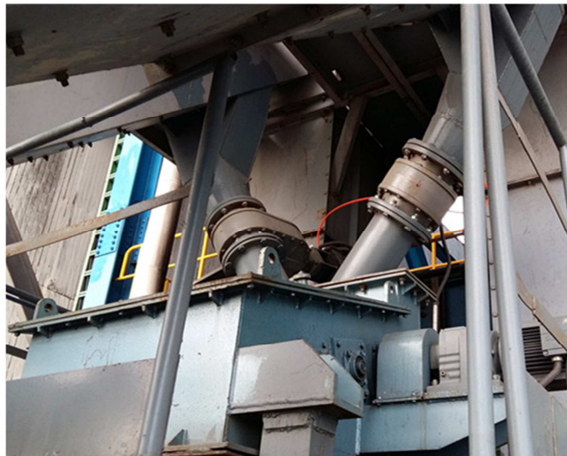
Figure 2. Ultra-fine roller screen located in the top of the slag bin.

is mastered by setting the level gauge. The operation of the bed material preparation and filling system and the material level signal of the bed material tank are connected to the control room. The bed material preparation, filling or stopping operation can be carried out at any time according to the operation of the boiler.