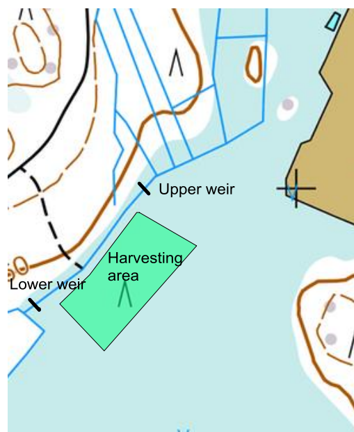
Figure 1. The schematic map of the study site.

Runoff (l s -1 ha -1 ), pH, suspended solids (SS), dissolved organic carbon (DOC) (mg l -1 ), total nitrogen (N tot ), ammonium-nitrogen (NH 4 + ), nitrate-nitrogen (NO 3 - ), total phosphorus (P tot ) and phosphate-phosphorus (PO 4 3- ) (µg l -1 ) concentrations were monitored at the study site during October 2009-October 2010. Runoff rates were measured using triangular Thomson's (90°) measuring weir (introduced by James Thomson first time in 1859) equipped with an automatic water level recorder allowing continuous measurements. The runoff rates were measured only below of the harvesting area (lower weir), and they were assumed similar to above of the harvesting area (upper weir) (Figure 1). Water samples were taken approximately biweekly from both upper and lower measuring weirs during summertime (May-October). During winter (November-April), water samples were taken ca. monthly if there was existing runoff.