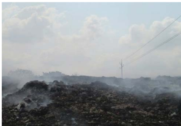
Figure 5. Occurrence of fire at Abokobi dumpsite.

better waste handling techniques employed at Kpone landfill accounted for its low fire incidence. Fires are common at dumpsites. It can cause serious damage to the infrastructure of the landfill and can be a major hazard for site staff. Additionally, landfill fires can create significant problem (in terms of health, air quality and social acceptance) with the surrounding neighborhood (Figure 5).