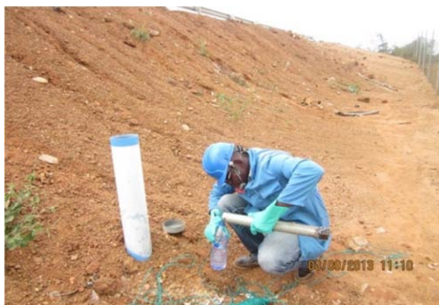
Figure 7. Sampling of ground water wells for analysis © 2013.

Groundwater was monitored once every year at Kpone landfill to examine the functionality of the base liner and extent of pollution from leachate. This monitoring is done by sampling a ground water monitoring wells (upstream and downstream) located at the base of the landfill, illustrated in Figure 7. There was no monitoring for pollution at both Abokobi and Nkanfoa dumpsites. The monitoring period identified was adequate as recommended by [23] which states that at least once a year monitoring of upstream and downstream groundwater wells is sufficient. According to [8], the disposal of waste materials has effects on air, water, soil and landscape.