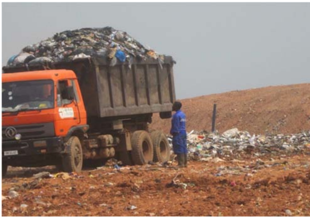
Figure 2. A spotter at the working face of Kpone landfill directing unloading trucks © 2013.

After unloading, waste is leveled and compacted with the use of bulldozer and landfill compactor respectively as found at Kpone and Abokobi dumpsites. Reference [17] stated that effective placement of waste is affected by experience and training of operators. It was observed that compactor was making 4-5 passes on the leveled refuse. However, compaction density could not be ascertained. At the Kpone dumpsites, waste placement was done on a flat surface area.