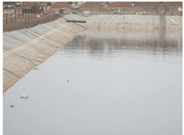
Figure 3. Anaerobic pond for leachate treatment at Kpone dumpsites © 2013.

There was an underground pipe drainage system connected to drain chambers at the base of the cells and a pumping machine at Kpone landfill. Abokobi also had a drain on site but was full of litter. There was no drainage system at Nkanfoa dumpsites. The absence of better drainage system at both Abokobi and Nkanfoa dumpsites could contribute to the flooding of the sites during the raining season preventing refuse trucks from dumping, due to its inability to access the road. Figure 3 illustrates how leachate was controlled at Kpone landfill through the use of facultative and anaerobic ponds.