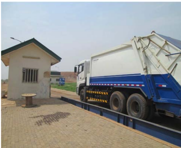
Figure 1. A truck on a weighing scale at Kpone Landfill.

Table 1 shows equipment and vehicles used in landfill operations for different landfill types. Kpone landfill had the highest number seven (7) while Abokobi dumpsites had four (4) landfill equipment on site. Nkanfoa dumpsites had no permanent machine on site. Landfill equipment and vehicles available for operations includes bulldozer, excavator, landfill compactor, pick-ups and tipper trucks (Figure 1). Bulldozers were used for pushing and leveling of waste. Excavating of cover materials and subsequent transporting to working face were done by excavator and tipper trucks. The Pick Ups serve as operational vehicle. The high number of equipment and vehicles at Kpone landfill could be attributed to the large quantity of refuse it receives daily (1,300tons) when compared to Abokobi and Nkanfoa dumpsites which receives 400tons and 138.6tons respectively. Reference [21] recommends 1 caterpillar tractor, 1 wheel loader, 2 compactors, 1 vehicle (all terrain), 1 small bus and 1 sweeper with a water tank. Kpone landfill and Abokobi dumpsite are justified to have the available equipment on site as their machinery level falls within the recommended level of landfilled waste ( \geq 400 tons per day) that are required machinery for economic reasons, put forward by [19]. However, the total number of landfill equipment for Abokobi dumpsite when compared to the quantity of refuse it receives daily(400 tons) points to the fact that the equipment are underutilized.