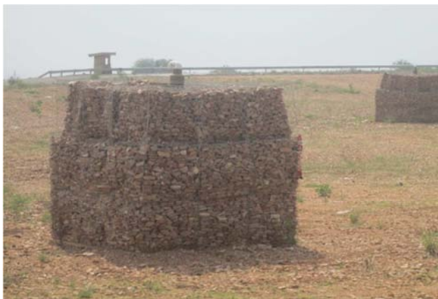
Figure 4. Gas extracting structure at Kpone landfill © 2013.

There was a facility to extract gas generated within the degraded refuse at Kpone landfill. The facility consists of High Density Polyethylene (HDPE) pipes inserted in Gibeon cages. The Gibeon cages are then filled with stone boulders as shown in Figure 4. The pipes are vertically installed at a depth of 2m inside the refuse. However, the extracted gas was not utilized but discharged into the atmosphere through venting. Abokobi and Nkanfoa dumpsites had no gas extracting facility. Odor emanating from the dumpsites was high compared to that of Kpone landfill. The high amount of odor at the dumpsites could be attributed to the fact that decomposition of waste was taking place in the presence of air (Aerobic). On the other hand, decomposition of waste at Kpone waste was anaerobic (i.e. in the absence of air) thus less amount of odor emanating from the landfill. Management of landfill gas in particular methane, is of importance due to its explosion risk and its high greenhouse gas potential. Landfill gas represents a major source of greenhouse gas emission up to 5% of total greenhouse gas emission in developing countries [23].