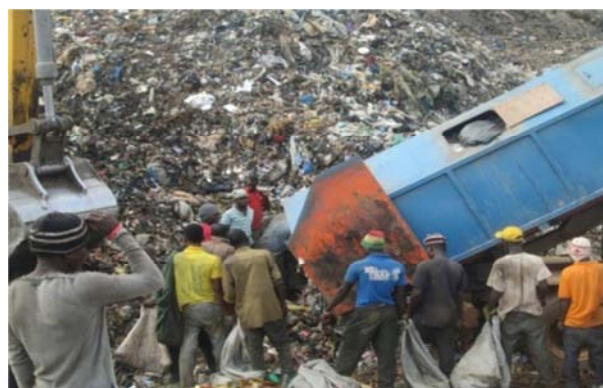
Figure 6. Unloading truck surrounded by scavengers at Abokobi dumpsites © 2013.

Scavenging activities were found in all the landfill types. At Kpone landfill, however, scavenging activities were controlled. Scavengers were registered and wore appropriate clothing (e.g. hand gloves and reflectors). They were allowed to undertake scavenging between 8am–3pm daily. There was a scavenging yard to contain materials recovered from the waste. There is also a shed which serve as a changing and resting room for scavengers. They were found to assist in litter control and weeding around the landfill site. An average of about twenty five (25) scavengers was found to visit the landfill daily. At both Abokobi and Nkanfoa dumpsites, scavengers were not controlled and were found wearing inappropriate clothing. They had unlimited access to the dumpsites and was identified as a source of landfill fires on the dump sites. About fifteen (15) and Ten (10) scavengers was identified in visiting the Abokobi and Nkanfoa respectively. Figure 6 demonstrates activities of scavengers upon the arrival of a truck.