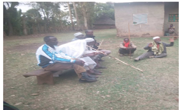
Figure 1. When the informants are interviewing.

Let the creator make you Wabe River of the summer let the creator make you the sweet like honey Let the creator make you the strong tree on the Mountain Let the creator make you the one who are not disappeared or removed