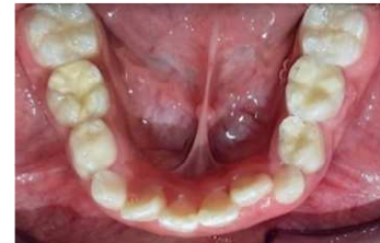
Figure 5. Lingual frenulum with kotlow's class II.