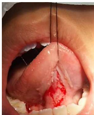
Figure 9. Lingual Frenuloplasty.