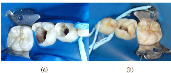
Figure 3. Pulpectomy treatments of (a) 74, 75 and (b) 85.