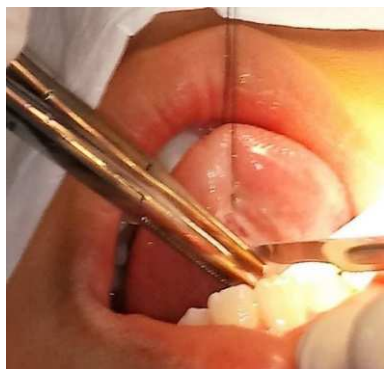
Figure 8. Hold the frenulum with two mosquito forceps and section the frenulum with a scalpel.