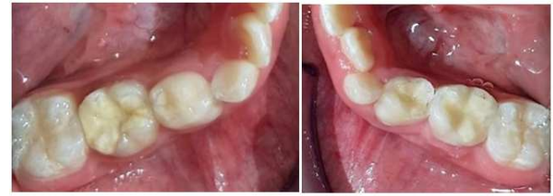
Figure 4. Restoration of (a) 74, 75, (b) 84, 85.