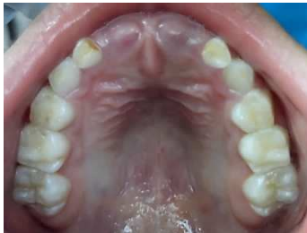
Figure 1. Maxillary occlusal view.

The full diagnosis after an intraoral clinical examination were ankyloglossia of lingual frenulum in a kotlow II category (moderate). The frenulum measured 10 mm. (Figure 5). In addition, the patient presented carious lesions on tooth pieces # 7.4, 7.5, 8.3, 8.4, 8.5. Also, tooth pieces # 7.5, 8.4, 8.5 had pulp involvement (Figure 2). Makeover, the patient presented deep grooves in pieces # 16, 26, 36, 46 (Figure 1).