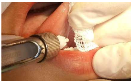
Figure 6. Lingual frenulum with kotlow's class II.

availability of time of the patient). In his last control, satisfactory results were observed in the mobility of the tongue, as well as in the restoration of the phonation function.