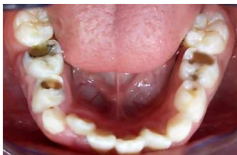
Figure 2. Mandibular occlusal view.