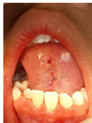
Figure 10. Suture.