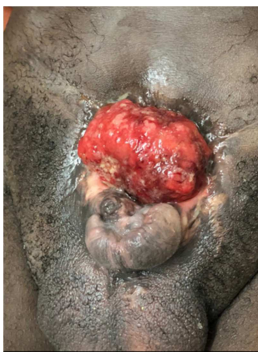
Figure 2. Preoperative view of the patient with exstrophy-epispadias complex. Bladder plaque showing ulcerated areas.

Case 2: A 28-year-old patient referred for management of an EEC evolving since birth associated with bilateral groin hernia. He had a good general condition (ECOG score 1), a bladder plate with complete epispadias (figure 2). The ureteral meatus were visible on each side at the lower part of the plate. Additional examinations had shown normal serum creatinine. The hemoglobin level was 12 g/dl and there was a non-specific biological inflammatory syndrome. He initially had a bilateral cure of the hernia and an attempt to close the bladder plate. The follow-ups were marked by a loosening of the sutures at the level of the hypogastric wall repair. Eight months later, a cystectomy and urinary diversion according to Bricker were proposed and performed. Histopathological analysis of the plaque revealed bladder adenocarcinoma (figure 3). No cancer tissue was detected in the resected prostate or lymph nodes. Following surgery, no adjuvant therapy was applied. The follow-ups were simple, and the patient was discharged on day 12. He was lost of sight and returned to consultation a year later with a hypogastric mass and pelvic shielding compatible with local recurrence of the cancer. The patient was referred to medical oncology and radiotherapy for further treatment).