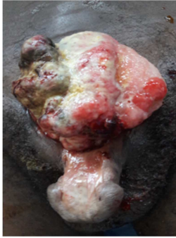
Figure 1. Preoperative view of the patient with exstrophy-epispadias complex. Bladder plaque showing ulcerative budding tumor on the upper right.

well-differentiated bladder adenocarcinoma. The thoraco-abdomino-pelvic CT scan revealed inguinal lymph nodes but there were no secondary visceral localizations. Radical cystectomy and urinary diversion with a ileal conduit, and an expanded local lymphadenectomy was Indicated. The patient died on day 8 of hospitalization before performing the surgery.