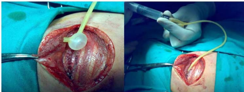
Figure 1. The tip of a Foley's catheter No. 10 F was introduced between the pleura and the rib cage with the balloon was inflated by 10 cm saline.

procedure was repeated using Foley's No 12 F and 14 F inflated with 20 and 30 cm saline respectively until the pleura was separated from the rib cage and the Azygous vein became visible (figure 2) (we used different sizes of catheters in order not to exceed the capacity of the smaller ones by larger volumes of fluid). The operation was completed as usual and a Nelaton catheter No 18 F was inserted in the chest outside the pleura as a drain at the end of the operation. The time used for pleural dissection was calculated beginning just after division of the intercostal muscles till visualization of the azygous vein. Intraoperative pleural tears were recorded; those that were 2 cm or less were considered as minor tears and larger ones were considered as major tears. Patients were followed postoperatively by regular chest examination and plain X-ray chest after 5 days looking for postoperative pleural complications.