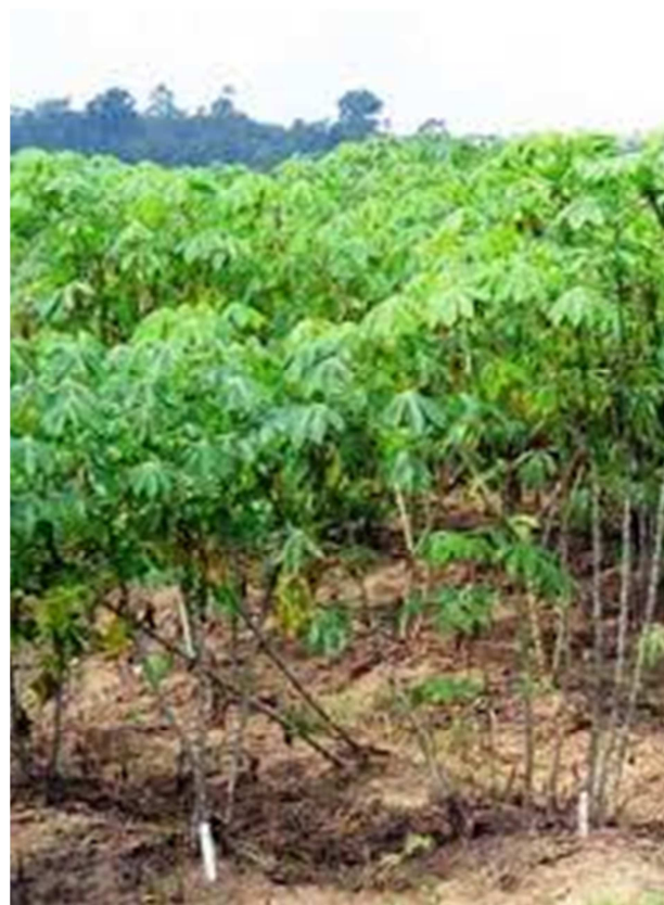
Figure 1. In-field storage.

The rapid deterioration of cassava roots after harvest has led farmers to leave the roots in the ground until they are required. That is the unharvested roots are left in the soil after the time of ideal root development and are harvested as and when they are required for utilization processing and marketing. The technique does not provide any form of expenses for erecting any structure. In-field storage has been shown to lessen postharvest losses [18]. More recently, [13] reported that 72% of cassava farmers in Rwanda delay cassava harvesting for over one year. Although the practice increases the size of the roots to some extent and also stores the root for an additional one or more years, the practice is without disadvantages. The technique decreases the efficiency of the land as it can't be utilized for the cultivation of new roots. [14] report that greater losses occur when roots are left unharvested in-ground during the dry season when the ground becomes dry and hard. According to [19, 17], Cassava roots become easily susceptible to attacks by pathogens and also decrease in starch content when left unharvested in the ground. because old roots occupy the land. In-field storage renders roots to become more woody and fibrous resulting in lower nutritional constituents as a result of high extreme temperatures, attacks by rodents, insects, and nematodes. Fresh roots harvested from in-field rots within 24 to 48 hours and must be immediately used for its purposes.