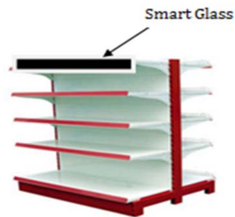
Fig. 3. Proposed smart glass.

keep up an appropriate record of the items present there is need of the "Brilliant glass". Shrewd glass is a gadget which will help the shopping center power with keeping up the number of items, illuminating the power, the director of shopping center and the sellers of the particular item if the amount goes underneath the limit level. Keen glass contains a RFID peruser which will include the quantity of items one take, keep a record and upgrade in database in like manner. Inventory is very helpful to owner as well as vendors also this inventory give indication to the customers products are available or not. With the help of inventory mall management team automatically get the alert if the product is less than the threshold. So if such condition is occurs one message will send to vendors then vendor pass the products to smart mall. This application provides a very high efficiency in supermarket.