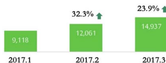
Figure 1. Trends of article reading in WeChat (2017Q1) [1].

General semantics mainly research on the relationship between human language and the objective of life, pursuing the meaning of scientific and accurate language expression. General semanticist think if everyone could act as a scientist in their use of language, it can guarantee the correct transmission of meaning then reduce misunderstanding and disputes between people. General semantics was born in the United States in the 1930s, flourished in the 1950s but began to decline rapidly in the late 1960s.