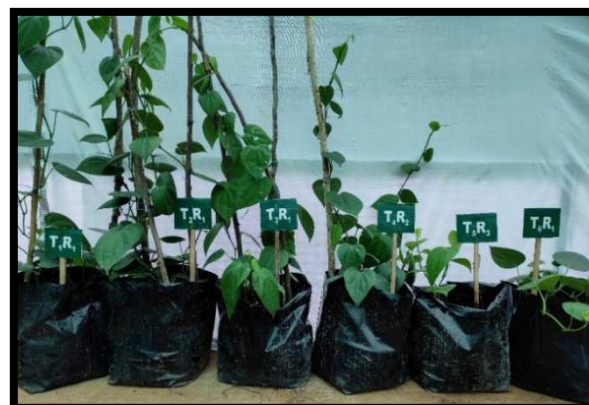
Figure 3. Effect of PGPM on plant growth.

number of leaves and internode length throughout the growth period from planting to five MAP (Figure 3 and Table 7).