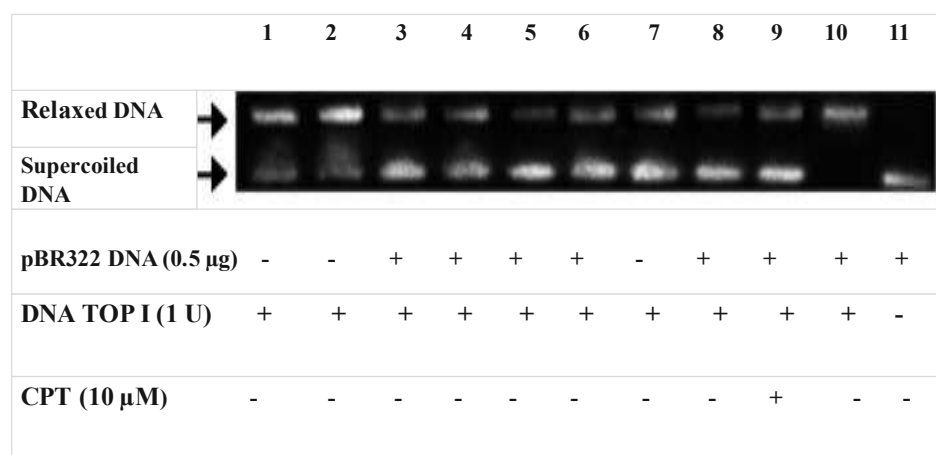
Figure 2. DNA Topo I inhibitory activities of Extracts at 25 µM (DNA + Topo I + tested compounds). Positive extracts; AMSAE (lane 1), AMPEME (lane 3), AMPEAE (lane 4), ASSME (lane 5), ASSAE (lane 6) and ASPEAE (lane 8). Negative extracts; AMPEEA (lane 2) and ASPEME (lane 7). Positive control; (DNA + Topo I + CPT) (lane 9, Negative control (DNA + Topo I) (lane 10) and DNA alone (lane 11).