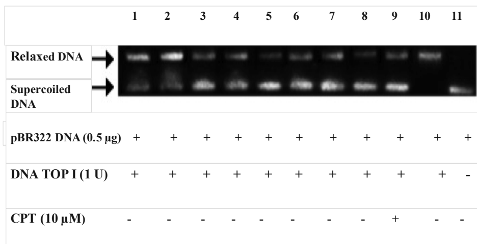
Figure 1. DNA Topo I inhibitory activities of Extracts at 100 µM. Extracts (DNA + Topo I + tested compounds); ASPEAE, ASPEME, ASSAE, ASSME, AMPEAE, AMPEME, AMPEEA and AMSAE in lane 1-8 respectively. Positive control (DNA + Topo I + CPT) lane 9. Negative control (DNA + Topo I) lane 10 and DNA alone lane 11.

I inhibitory activity while negative DNA Topo I inhibitory activity was observed in five extracts; AMSAE lane 1, AMPEEA lane 2, AMPEAE lane 4, ASSAE lane 6 and ASPEME lane 7 (Figure 3).