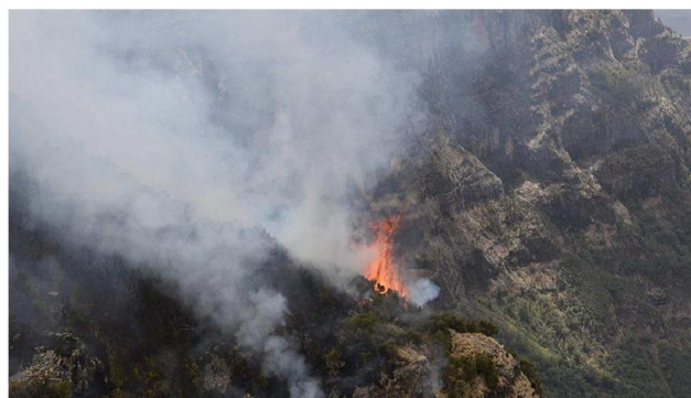
Figure 2. Semien National Park, Africanews (2019).

The current policy projection result of ‘Climate Action Tracker’ 5 shows that Ethiopia became one out of countries that have long term targets and short term policies to limit the warming by 1.5°C by minimizing deforestation scale, and maximizing the forestation and reforestation measures. However, the Ethiopia government commitment is not at all consistent with the Paris Environmental Agreement (1.5°C). Therefore, if the Ethiopia government measures goes similar with the current trend, then by the 2025 the country’s warming would increase by 3-4°C. This shows that the country’s environmental policy and practice lacks important aspects (implementation and policy gap) that prevent the country’s GTP II from the realization and the 2025 green transformation will be impacted highly. As a result, the country’s environmental visibility became associated highly with the political significances at international arena and domestic political affairs.