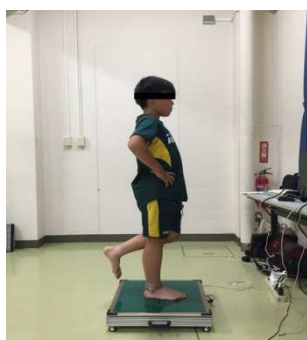
Figure 1. Posture of the participate during the COP control test.

The laboratory equipment used was a centroid oscillation system T.K.K5810 (Takeki Scientific Instruments Co., Ltd. Japan) with four built-in acceleration sensors for Windows 10. The device was connected to a Windows PC and a 27-inch monitor (resolution: 1920 \times 1080 ). The body balance control test conducted with these systems measures errors between the moving target on the monitor and the participant's COP over time and was developed based on previous studies