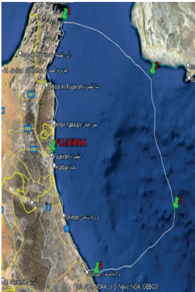
Figure 1. Area of interest: 100 km off the coastline of Emirates of Fujairah.

The area of 100km radius, off the coast of emirate of Fujairah has been selected for the estimation of percentage of various types of cloud analysis. The data for 9 months starting from January 2022 to October 2022 has been retrieved from the Copernicus satellite data component through the Sentinel 3 LST F2 channel, utilising Python packages and the Google Earth Engine.