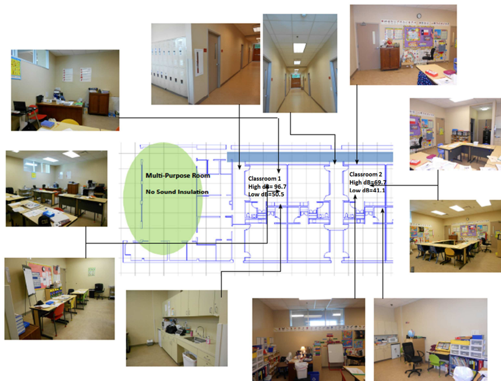
Figure 2. School 2 layout and images. 3