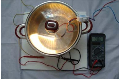
Figure 2. The circuit is prepared and taken picture by author Ensan for possibility of current leakage measurement. The bar light placed inside the metallic pot that is insulated from the ground by 2 layers of polyethylene sheets (not showed in the figure) and a Styrofoam layer of \frac{5}{8} inch thickness. The clip of common wire connected to the edge of pot and the wire of current (A) socket connected to the ground wire. Multi meter selector was set to its highest resolution (200 \mu A). The result of current after several times of measurement was zero and the result of relative voltage to ground (has not been shown in this figure) was almost zero (one time showed 0.3 mV).

current of zero. The waiting time period for possibility of collecting electrons on the surface of pot was 10 minutes before each measurement. The result of possibility the leakage current or escaping electrons from the light bar in these tests is negligible. The conclusion could be that some the missing part of electrons which is the difference between positive and negative sides of light bar have been broken to photons with different frequencies of visible light and infrared, etc.