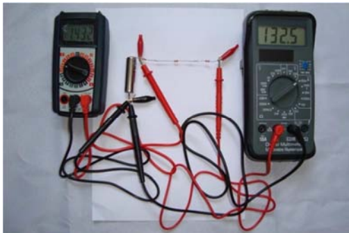
Figure 3. The circuit prepared and taken picture by author Ensan for considering the difference of amperage between the locations of before and after three tiny resistances connected in series with total resistant of 9.81 K \Omega . The ammeter shows the current of 132.5 \mu A. The average obtained difference current is \Delta I = 40 nA. The same experiment is done with the same circuit but instead of 1.5 V, AA battery that figure shows 1432 mV, a 9 V, 6F22 has been used. The average difference amperage obtained \Delta I = 1941 nA.

Using two kinds of Multi meters with different ranges and also convertor which its voltage fluctuates make the first test results difficult. In this test a single Multi meter with the highest possible range resolution (200 \mu A) and a single battery AA with nominal voltage of 1.5 Volts is used to cancel the fluctuation of line voltage.