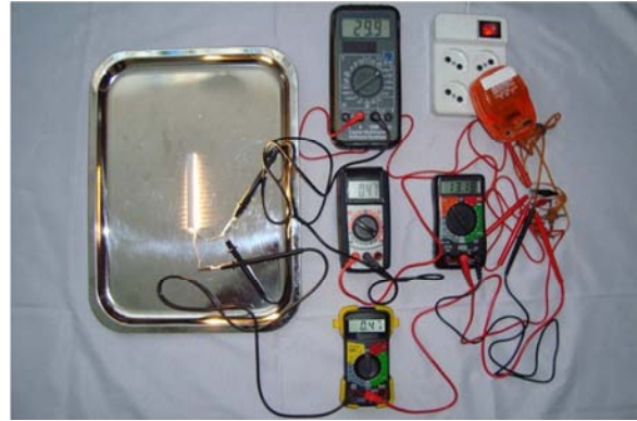
Figure 1. The circuit prepared and taken picture by author Ensan for current measurement before and after LED. The upper and middle left ammeters (Ampere meters) connected parallel to measure the current of one side of light bar and the lower ammeter measures current of another side of LED. There is difference between them. At the middle right a voltmeter measures the circuit voltage. Light bar placed inverse on the tray for avoiding its glare to eyes.

range of the negative side is A. After each measurement and the circuit was disconnected for time lapse of 20 seconds and then turned on, 10 seconds waited for stabilizing the circuit parameters, the amperage was measured. The tests repeated for 5 times, then the two ammeters connected to the positive side of light bar moved to the negative side and the ammeter connected the negative side moved to the positive side. The measurements repeated as table 1.