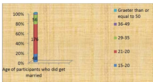
Figure 2. At what age did participants get married.

The result shows that the more than half of the subjects (60.7%; n=176) did get married between 21-28 years old.