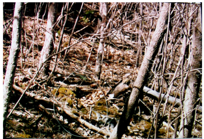
Fig. 3. A Gansitao set in the shrub as a trap for catching and strangling musk deer.

Unfortunately, since the mid-1960s, particularly the late-1970s, the population density and size of musk deer in China have dropped dramatically, the major cause being poaching with Gansitao, a circular tool made of steel or iron wires (Fig. 3), which is indiscriminate, killing individuals of any age or sex (nearly 1:1). This kind of easy-to-make-and-use trap is extremely destructive to musk deer populations (Liu et al. 2000b, Sheng & Liu 2007, Liu & Sheng 2008), because a network of Gansitao is not only easily set for a low cost in forest, but effective in the long-term at catching musk deer as well.