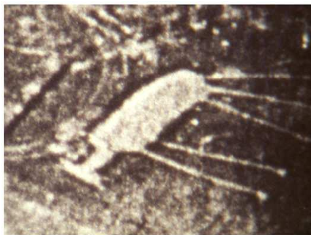
Figure 2. Horse geoglyph, Mojave Desert, southeast California, dated to about 900 years ago. [9, 66]

restricted the public from accessing the area and deciding for themselves (see Fig. 2).