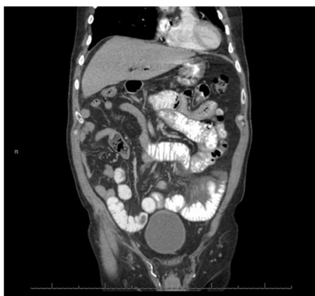
Figure 1. Mildly dilated loops of small bowel with decompressed loops of small bowel in the right lower quadrant.

Two weeks after admission, the patient was seen in gastroenterology clinic and complained of epigastric and poorly localized discomfort, early satiety, nausea, and diarrhea/loose stool. Patient stated he was adhering to full liquid diet and pantoprazole. A CT enterography was ordered and showed: jejunal diverticulitis with microperforation and significant phlegmon surrounding the inflamed diverticulum, no abscess in the abdomen, and few scattered diverticula in the jejunum. The patient was subsequently started on ciprofloxacin 500mg twice daily and metronidazole 500 mg thrice daily for seven days. Pt was seen in clinic two weeks later with complete resolution of symptoms after course of antibiotics.